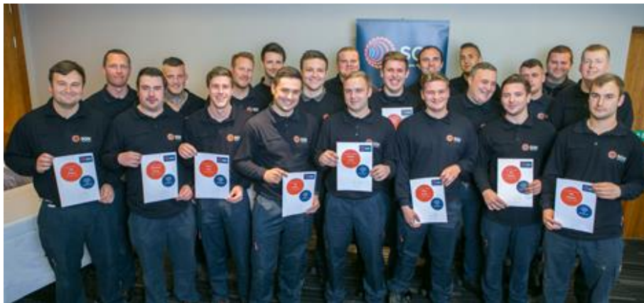
SGN's qualified apprentices from southern England.

To find out more about SGN’s apprenticeship programme, visit our Apprenticeship page.