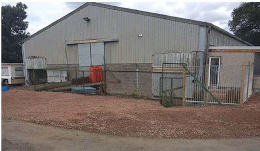
The car park after