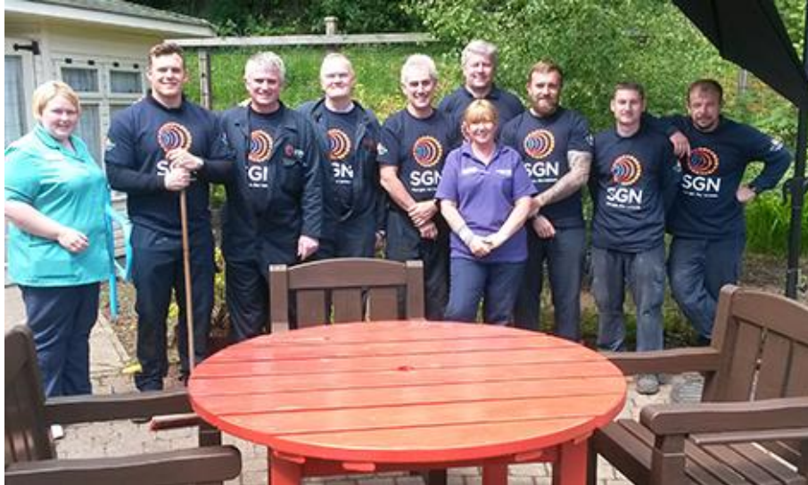
The Glasgow team take a breather from their work on the Erskine Estate.

Residents of Erskine Park, a care home for veterans living with dementia, are making the most of their newly spruced up garden this summer, thanks to a team of volunteers from our Glasgow (South) Maintenance team.