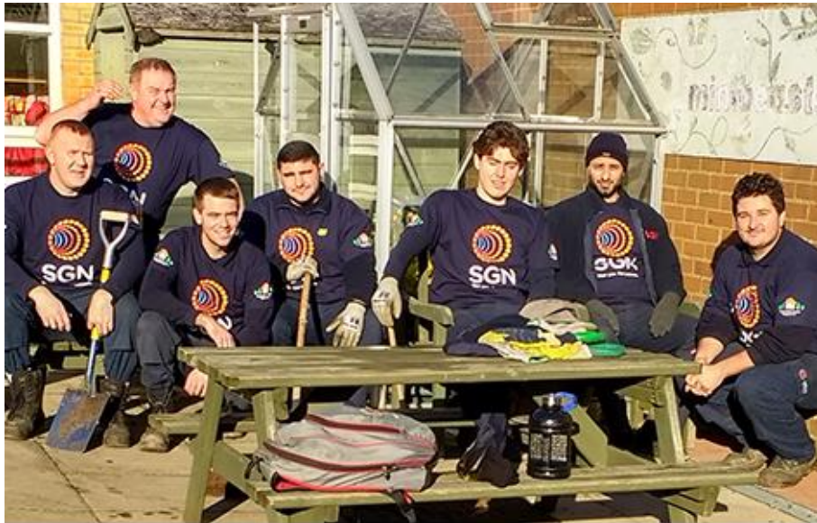
The SGN team taking a break from their work at St Stephen's.

Pupils at a Surrey primary school are eagerly anticipating the arrival of some furry (and feathered) friends this term, after employees from gas distribution company SGN cleared part of the school's grounds to make way for their new homes.