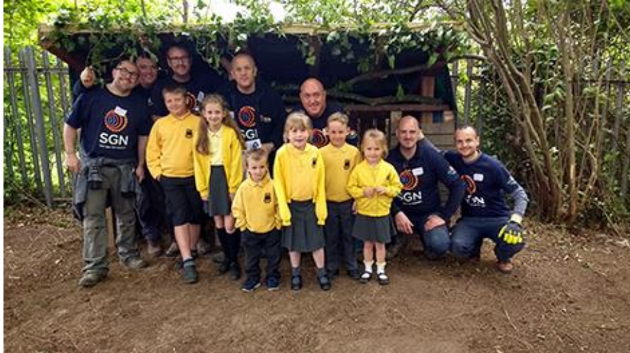
The SGN team show some of the High Firs pupils the shelter in their new outdoor classroom.

Pupils at High Firs, a primary school in Swanley, are enjoying the benefits of outdoor learning this term, thanks to a team of volunteers from SGN who helped create an outdoor classroom for them.