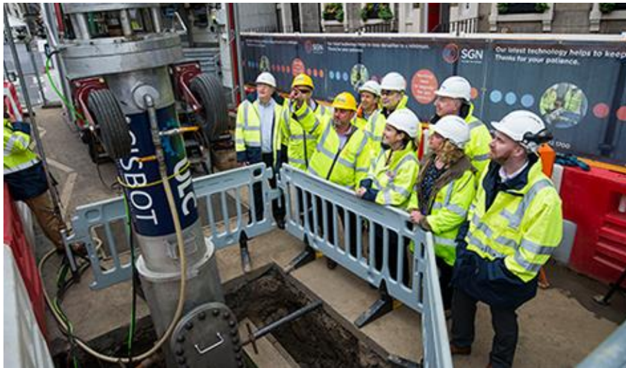
Street robotics in action on George Street in Edinburgh

The future of the UK's energy networks is being showcased this week at the industry's biggest annual innovation event, which is sponsored by SGN.