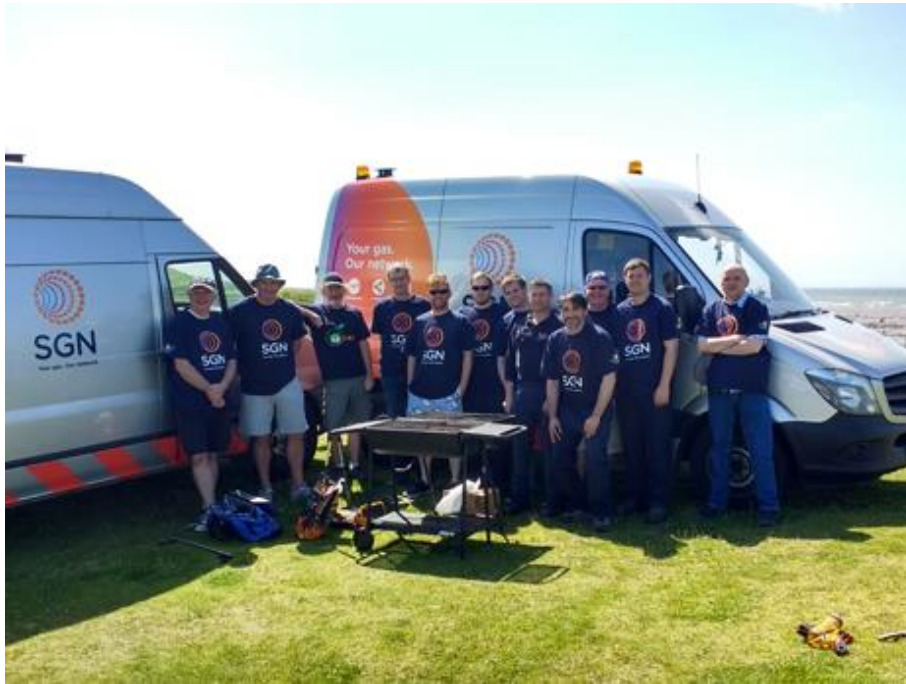
The team from SGN's Dundee depot take a break from their clean-up work at Lower Largo beach.

Volunteers from gas distribution company SGN cleared almost 15 bags of rubbish when they helped clean up Fife's Lower Largo Beach and Shell Bay recently as part of the company's Community Action Programme.