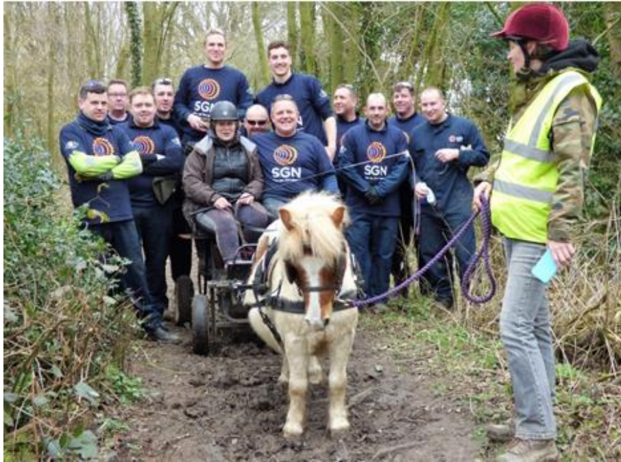
The SGN team 'road test' the new pathways.