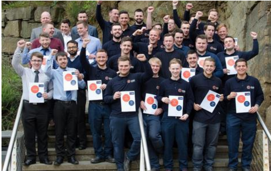
SGN's qualified apprentices from Scotland.

Time spent putting the theory and skills learnt at college into practice under supervision on-site has equipped all 47 with the expertise they need to start work in SGN's business. While the majority now have the range of skills they need to be able to work in the company's local depots, others have the specific knowledge needed to maintain the equipment that controls the pressure of gas in the network.