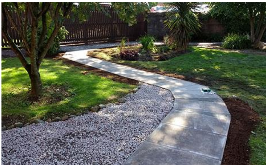
The finished pathway through the garden

Twelve volunteers from our Dumfries depot spent two days at the care home, laying paving-stone pathways through the garden to improve access for residents who walk with a frame or need a wheelchair. While there, they also painted fences around the garden's border.