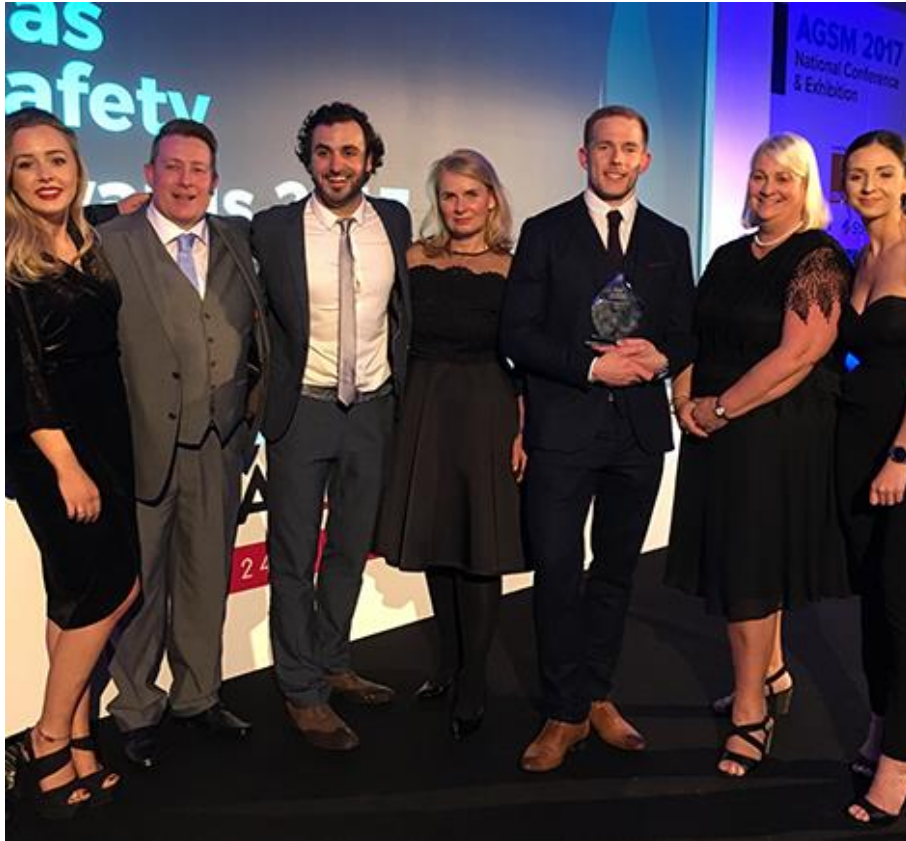
The SGN team at the AGSM Gas Safety Awards

At a ceremony at Glasgow's Scottish Event Campus yesterday, we were awarded the Silver Punch Bowl by the Scottish Chamber of Safety. This award celebrates the success of organisations in improving health, safety and environmental issues across Scotland.