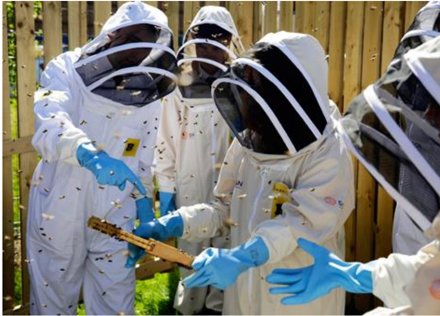
Bees land at Trinity High School