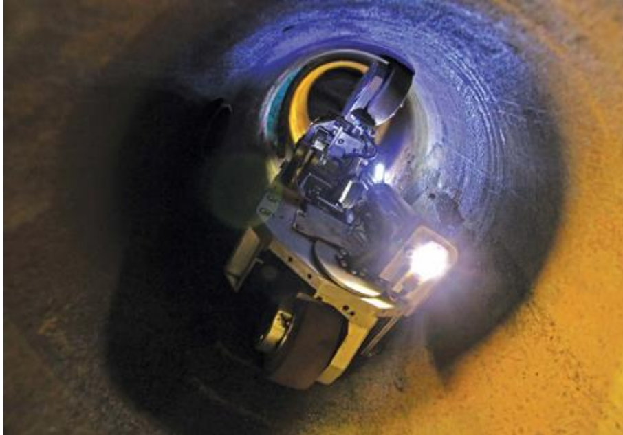
CISBOT in action to seal the joints in the pipes.

SGN will begin work to upgrade the local gas supply network in Church Road, Hove, later this week.