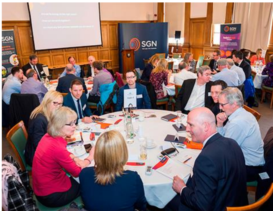
Guests divide into discussion groups to help SGN decided on its future priorities.

Gas distribution company SGN is giving its stakeholders the opportunity to have their say about how it runs key parts of its business, by holding a series of seven stakeholder workshops across the south of England and Scotland.