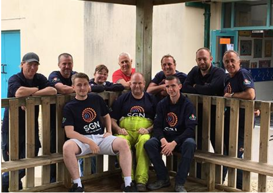
The SGN team take a break from their work at St Mary's Primary School.

Pupils at St Mary's Primary School in Gillingham are returning to a newly spruced-up playground and classrooms this week.