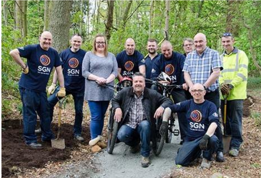
Our team show off the new cycle trail to staff at Seamab School.

Pupils of Seamab, a school and residential care complex in Kinross, are riding high this week after volunteers from our Dunfermline depot created a cycle track for them in their school grounds.