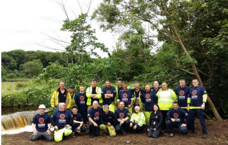
Volunteers from our Coatbridge depot at Millheugh country estate.

Volunteers from SGN teamed up with Lanarkshire environmental group Friends of the Calder to help improve the Millheugh Estate for the local community.