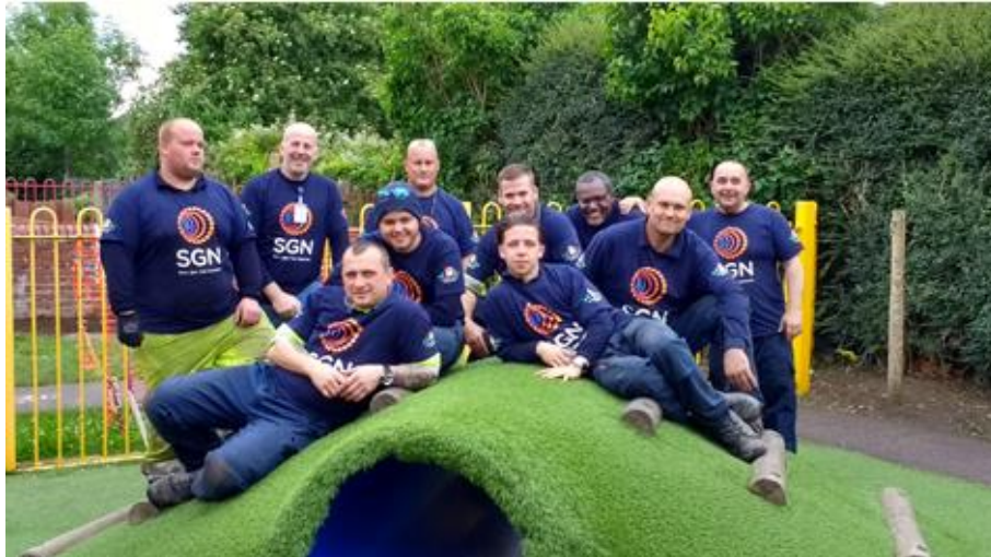
The team from our Reading depot take a break from their work at New Bridge Nursery School.

An army of volunteers from SGN arrived at New Bridge Nursery School in Reading last Thursday, ready to spruce up the children's playground.