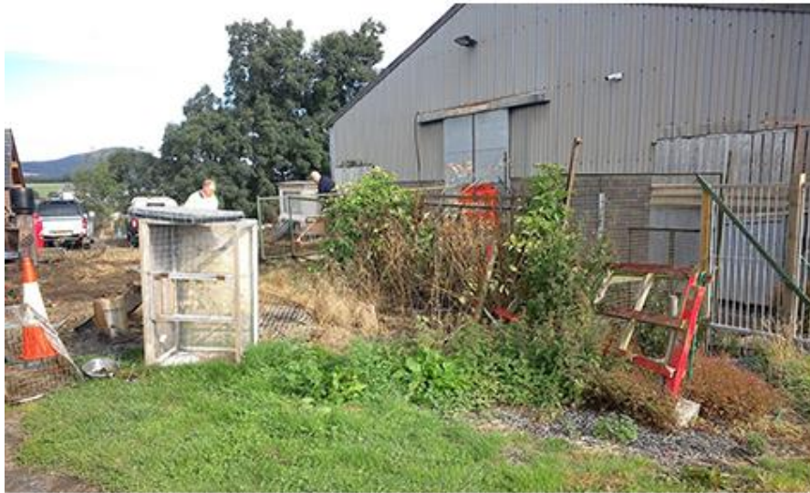
The car park before our volunteers got to work